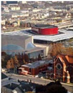
The Meyerson Symphony Center and Winspear Opera House in Dallas