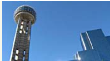
Reunion Tower and the Hyatt, Dallas