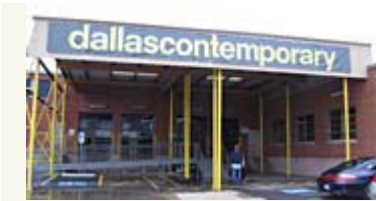
Dallas Contemporary in the Dallas Design District