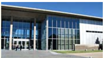
The Modern Art Museum of Fort Worth

Do you really want to know why Republicans won big? Ride the Amtrak! I dare you to take the overnight route from Chicago to Texas. Across vast and beautiful midwestern prairies, you will see foreclosure hell, small towns boarded up, decimated by the wretched economy. You will also see monstrous SUVs, carrying nothing, wasting fuel going nowhere. Whatever happened to jobs, green energy and hope?