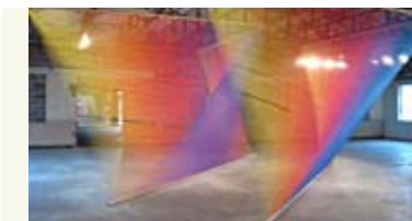
Gabriel Dawe's Plexus No. 4 at Dallas Contemporary