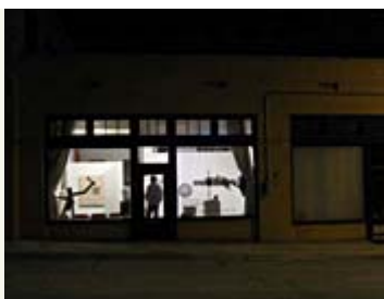
Mighty Fine Arts in Oak Cliff, Dallas