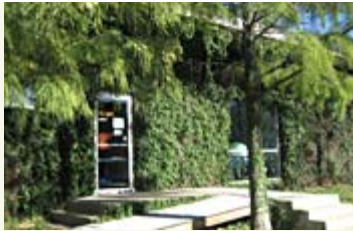
Cunningham Architects headquarters in Dallas, current home to Plush Gallery