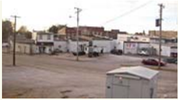
On our way to Texas