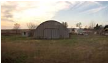
More of the Midwest