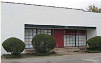
Barry Whistler Gallery, Dallas

In Fort Worth architecture rules with a triumvirate of heavyweights: the Modern Art Museum of Fort Worth , a beautifully massive concrete cathedral designed by Tadao Ando ; Louis Kahn 's masterpiece, the Kimbell Art Museum , across the street; and the Amon Carter Museum of American Art , designed by Philip Johnson , just a hop and a jump away.