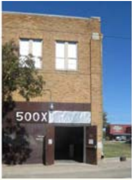
The artist co-op 500x in Dallas