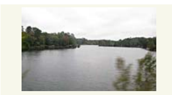
The great Midwest