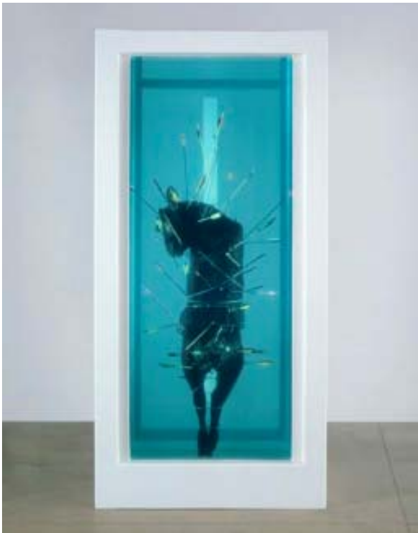
Damien Hirst, "Saint Sebastian Exquisite Pain"

Damien Hirst, the main organizer of "Freeze," set an example of artist-as-curator and artist-run exhibition spaces in the 90s. Hirst went on to become the world's most expensive living artist selling a piece for 160 million at Sotheby's in 2008. In the GMF is his "Saint Sebastian, Exquisite Pain," reportedly to cost $7 million. The 10-foot tall glass and steel case contains a black furry calf, stabbed with arrows, hanging from a white steel I-beam, and floating in water and formaldehyde.