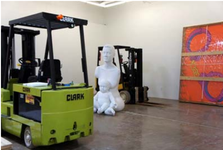
Installation shot in new space, sculpture by Marc Quinn, painting by Craig-Martin.

This announcement departs from our past exclusivity of Texan artists for moderndallas, because of the importance of the opening of the actively collecting non-profit Goss-Michael Foundation, founded in 2007. Its new larger headquarters with higher ceilings and larger doorways is strategically located close to the recently positioned Dallas Contemporary.