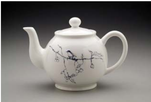
Tracy Emin, "Foundlings and Fledglings"

Former YBA Sarah Lucas (born 1962) is the featured artist in the traveling 2010-2011 British Art Show 7. Every five years it shows the next generation; this time stopping in London, Glasgow, Nottingham and Plymouth attracting 300,000 visitors. Out of a retail space in London, The Shop, she and Emin sold artworks they made ranging from T-shirts with slogans to printed mugs. Lucas has declined the Turner Prize nomination.