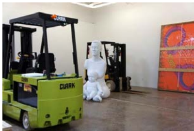
Installation shot in new space, sculpture by Marc Quinn, painting by Craig-Martin