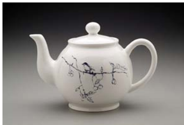
Edited teapot by Tracey Emin